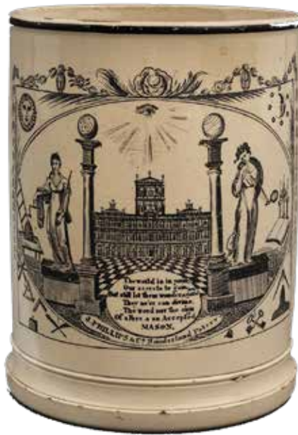
Mug, 1807-1820. J. Phillips & Company Sunderland Pottery, Sunderland, England. Special Acquisitions Fund, 87.28.

To add to its appeal, the maker of this cup added a surprise—a lifelike green ceramic frog attached to one