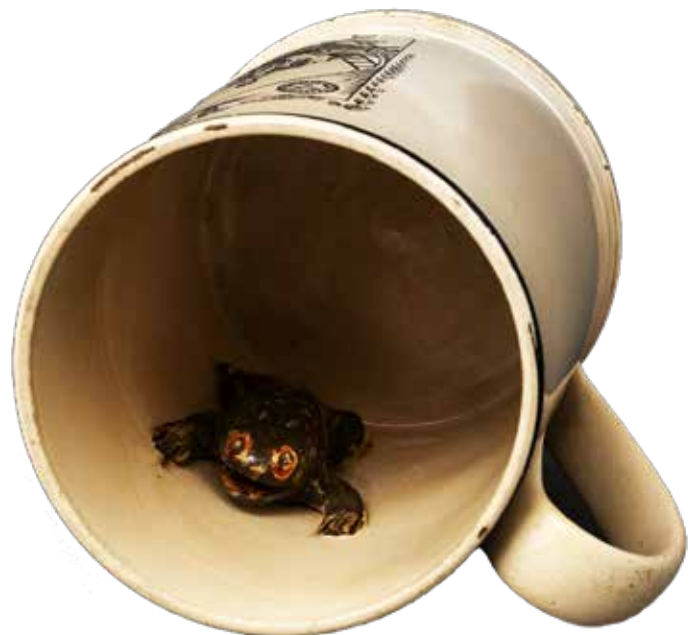
Interior, Mug, 1807-1820. Special Acquisitions Fund, 87.28.

Learn more about exhibitions and collections at the Scottish Rite Masonic Museum & Library at srmmml.org .