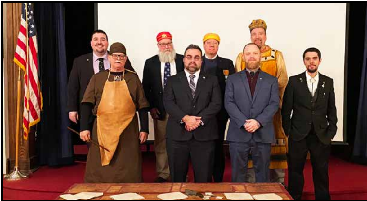
The Doric Lodge of Perfection, Valley of Waterbury, along with its candidates after a presentation of the new 4th Degree on Wednesday, February 5, 2020.