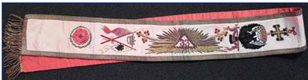
33rd Degree Sash, white or cream base, red lining reverse, gold fringe, red rosette, red glass, open at hip. 20th century