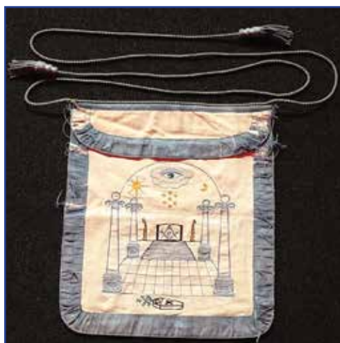
Blue Lodge Apron, early 1900's, shredded blue ribbon edge trim, cord tassels