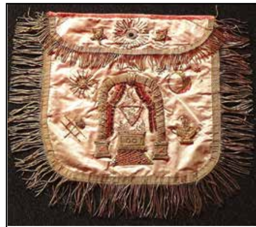
Royal Arch apron, bullion fringe, red velvet drape, heavily embroidered, no ties

The aprons and sashes will be on display in the lobby showcase at the Leo H. Lohrman, II, Scottish Rite Theatre in the upcoming Spring Degree season. Come to a Degree and see the display!