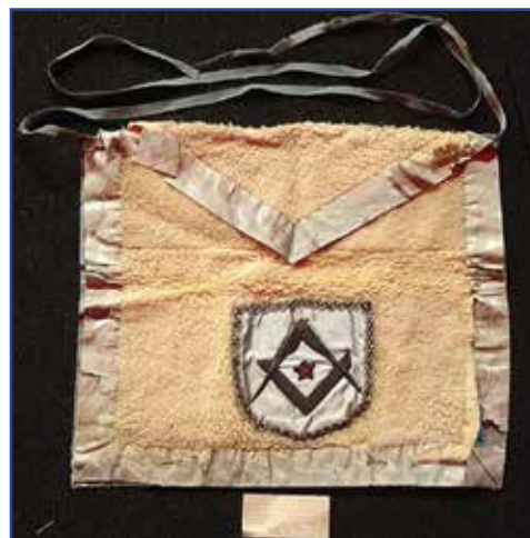
Lamb or sheep skin with fur, square and compasses on pocket, twill ties.