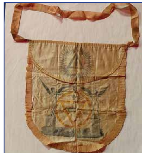
Royal Arch Royal and Select Masters apron, painted gold circle, printed winged females, loop tie, Jeremy Cross design.