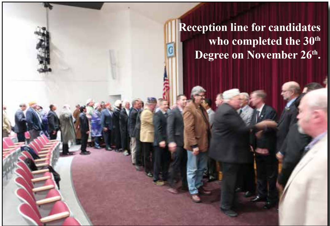
Reception line for candidates who completed the 30 th Degree on November 26 th .