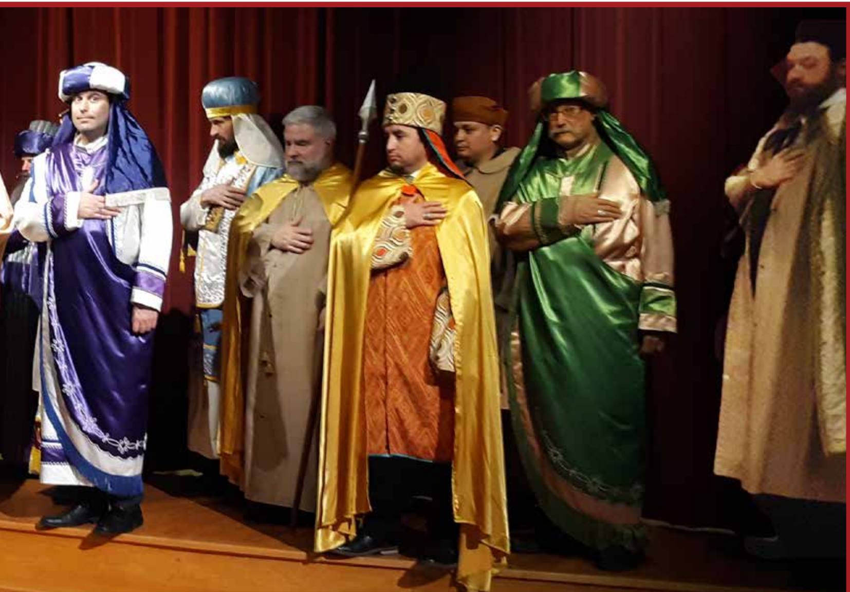
January 7, 2022: Cast of the 9th Degree