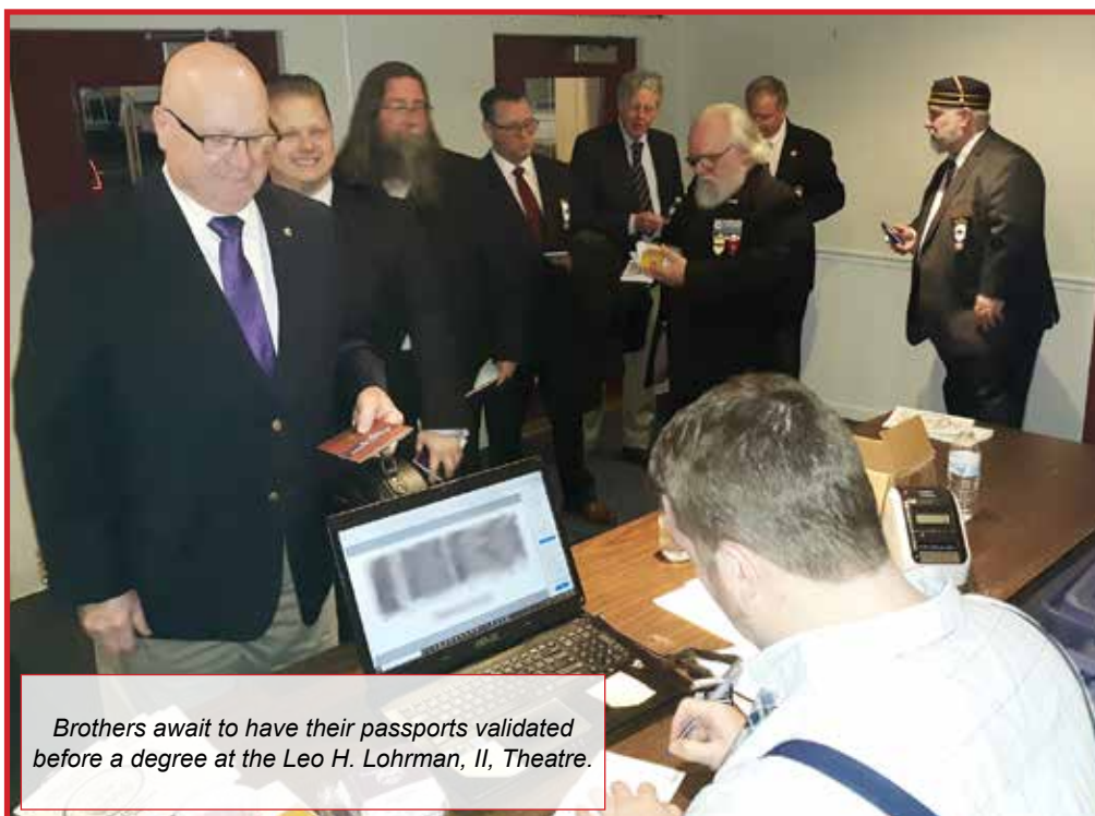
Brothers await to have their passports validated before a degree at the Leo H. Lohrman, II, Theatre.